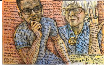
Word Art by Susan Shie

In art we will be developing our drawing skills. Our DT topic will be cooking and nutrition